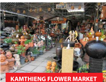
KAMTHIENG FLOWER MARKET