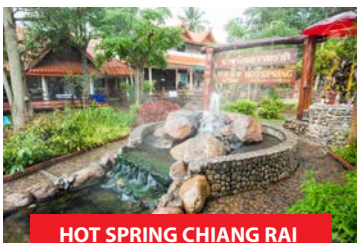
HOT SPRING CHIANG RAI