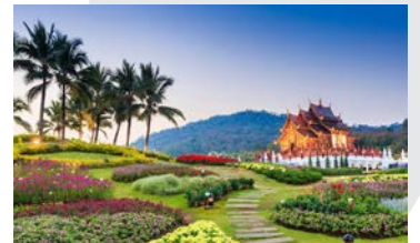
THE ROYAL FLORA RATCHAPHRUEK