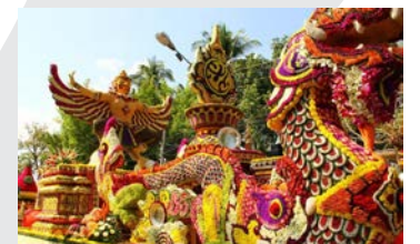
THAILAND FLOWER FESTIVAL